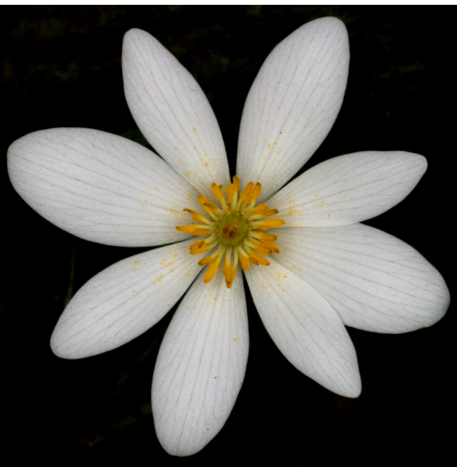
Sanguinaria canadensis (bloodroot)